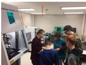
Students observe a laser welding demonstration.

Indian Hills Community College hosted 8th Grade Career Days on Friday, October 13th and Friday, November 3rd. Over 1500 students from 21 regional school districts attended the events. Students were able to learn about career opportunities and experience laboratory activities in over 40 career areas. Each student chose three career areas to visit while on campus.